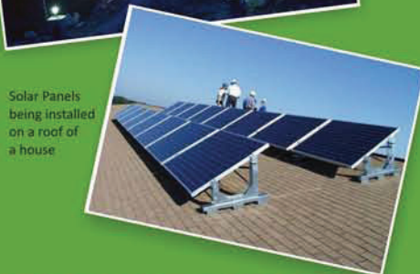
Solar Panels being installed on a roof of a house