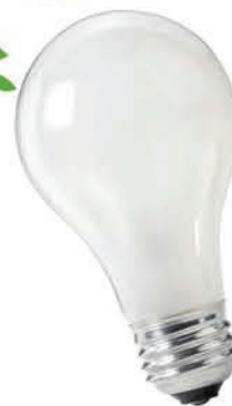
INCANDESCENT LIGHT BULB