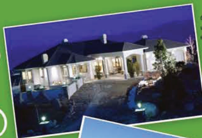
CFLs being used as exterior lights